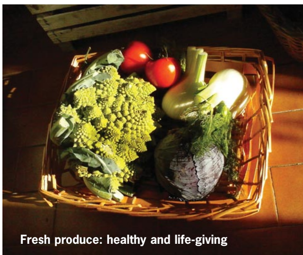
Fresh produce: healthy and life-giving

Following a weekend gathering in May 2015 when we explored how a Way (or Rule) of Life might be appropriate for Green Christian, we held our inaugural conference in January 2016, when many attendees registered as Companions.