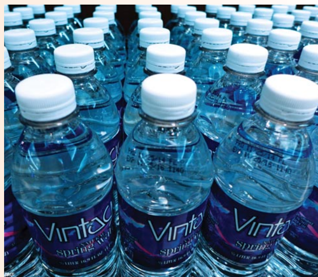
Bottled water: expensive and polluting